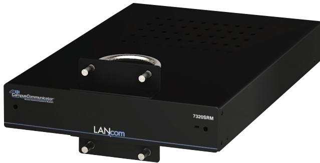
LC372SR with LC372PMK Pole Mount Kit